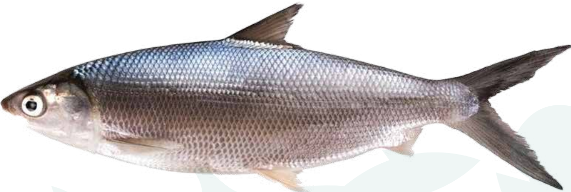
MILKFISH (BANDENG) Chanos chanos