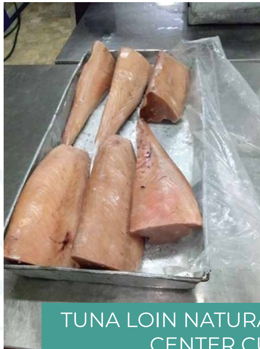
TUNA LOIN NATURAL CENTER CUT