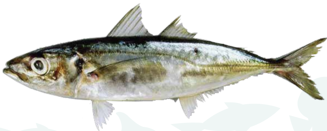
IKAN LAYANG Rastrelliger brachysoma