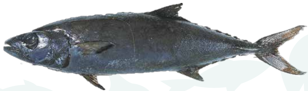
GINDARA Lepidocybium flavobrunneum